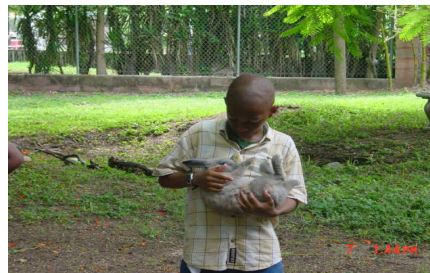
Child petting rabbit at Hope Zoo.

We are particularly proud of the following activities: