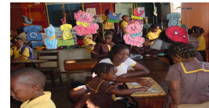
Harvest Temple Basic School, Portmore.

We are pleased to have been sponsors and partners in the following Child Development initiatives in Jamaica: