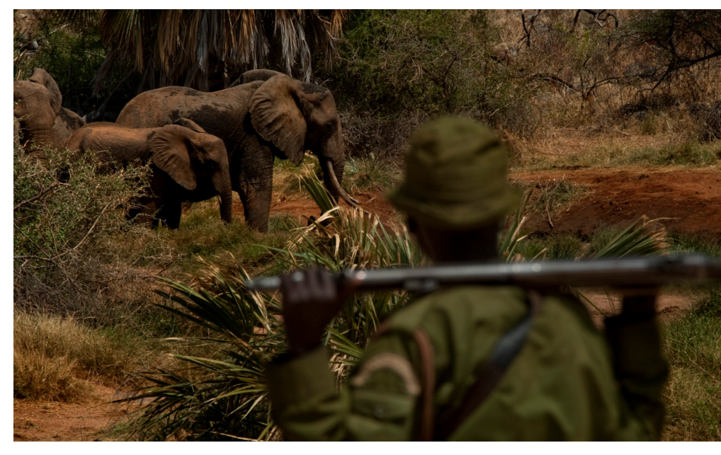
A community ranger observes a family of elephants.

approach to community-led conservation. Today, there are 26 community conservancies under NRT's umbrella, covering 3.6 million acres of Kenya's arid northerm rangelands. These are bringing greater security and peace, improving livestock productivity, creating jobs, and conserving wildlife in areas that have historically been marginalized and impoverished.