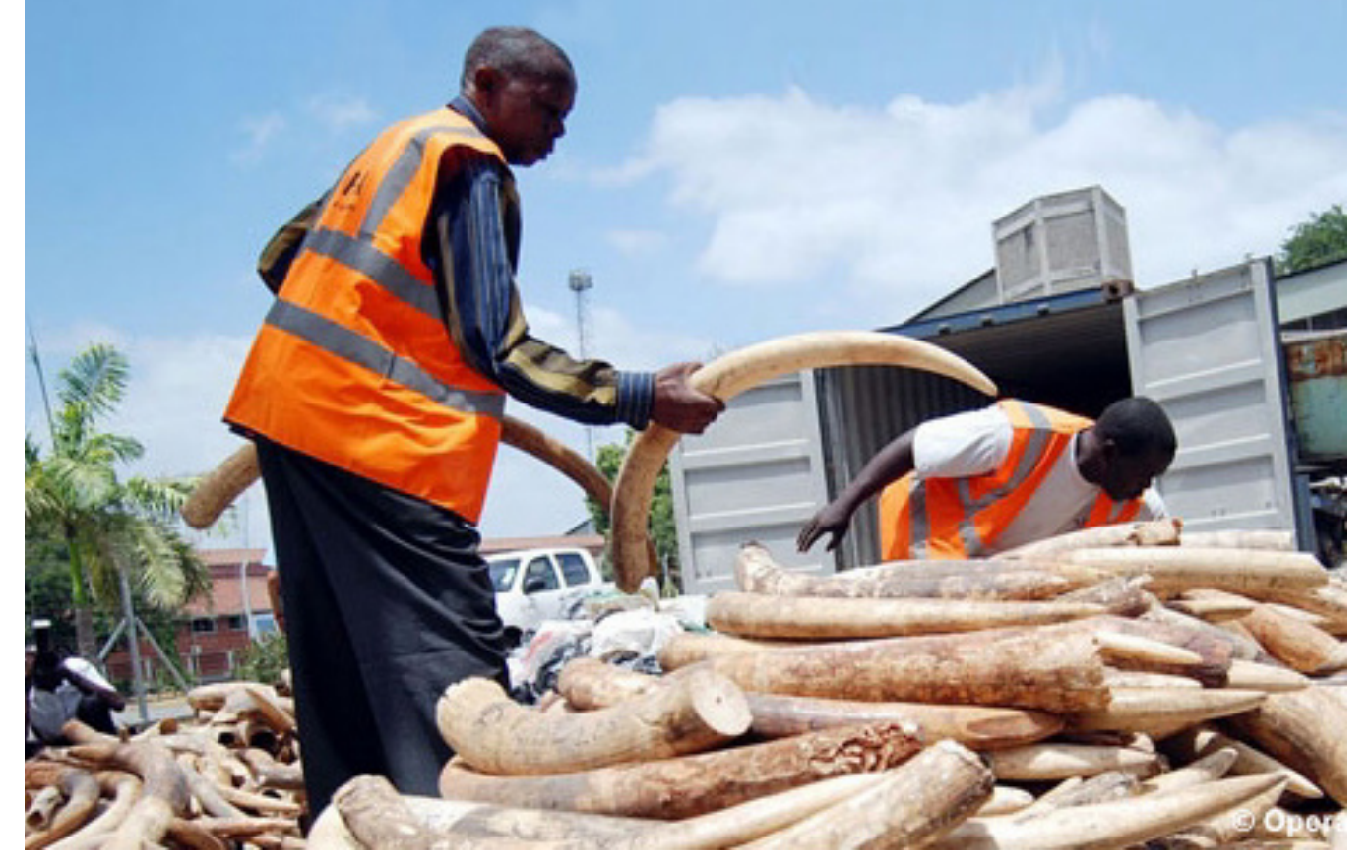
Inspectors sort Ivory confiscated in January 2013.

Agency CITES Enforcement Collaboration Group and ASEAN-WEN planned the collaborative action now known as Operation Cobra. Drawing on the expertise of partners such as World Customs Organization and the UN Office on Drugs and Crime, as well as several years of wildlife crime information collected by FREELAND, an international coordination team in Bangkok supported real time information sharing among participating law enforcement agencies and across borders. Cobra focused on the quality of investigations over the quantity of seizures, promoting specialized techniques that allowed several follow-up investigations into seizures of contraband.