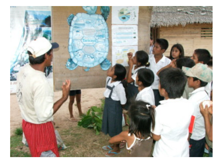
Schoolchildren learn about wildlife in Peru's Cordillera Azul National Park.

Cordillera Azul was established in 2001. following a three-week biological inventory by The Field Museum, which found an estimated 6,000 species of plants and 1,330 species of vertebrates, many endangered. More than 35 new species have been discovered in the Connecticut-sized park since that time. Intact forests stretch across a full altitudinal gradient of tall lowland rainforests to mountain-top elfin