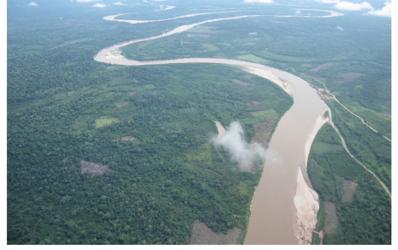
Cordillera Azul from the sky.

and fishing. The rate of deforestation in the buffer zone is 1.6 percent annually, with 440,000 hectares of forest lost between 1999 and 2010.